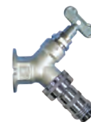
Optional Tee Key Included

Standard - Chrome (CH) Optional - Rough Brass (BR), or Polished Brass (PB)